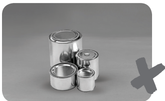
Paint cans or oil cans