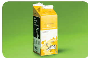
Gable top containers