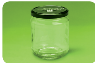
Glass food and beverage containers