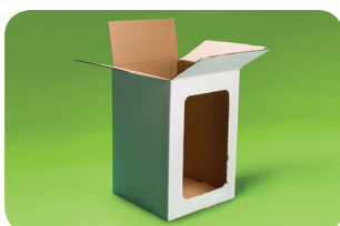
Residential corrugated cardboard