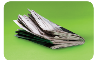
Newspapers and flyers

These are types of recyclable materials accepted in your recycling program: