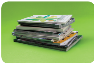
Magazines and catalogues