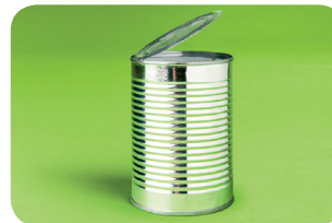
Steel food and beverage containers