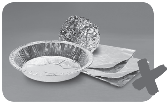
Aluminum foil, foil pie plates or foil food containers