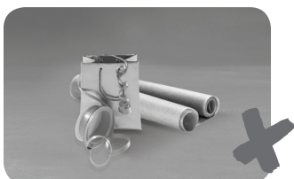
Wax or foil coated paper