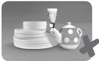
Dishes, ceramics or crystal