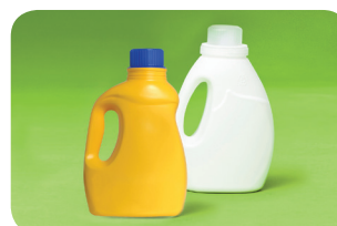
HDPE #2 plastic containers