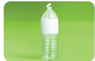
PET #1 plastic food and beverage containers