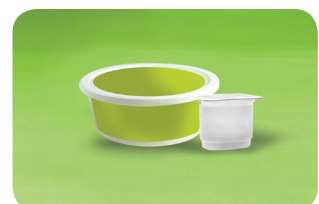
#4, #5 and #7 plastic containers