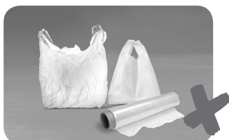
Plastic bags or cellophane