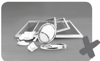
Window glass, mirrors or broken glass