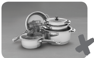
Steel pots and pans or scrap materials