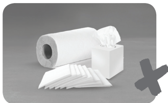
Paper towels, tissues or napkins