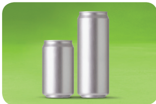
Aluminum food and beverage containers