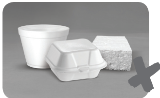
Foam packaging of any kind