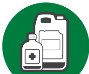
Unwanted pesticides & livestock/equine medications