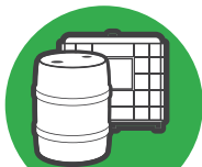
Totes & drums