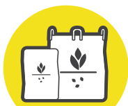
Bags & large tote bags