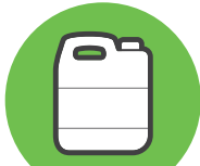
Containers up to 23L